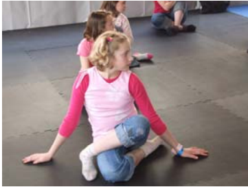
Workshop at 'BBC Blast!'

Green Candle was invited to lead two workshops over two days as part of 'BBC Blast on Tour 2007' held at Hertfordshire University. A total of twelve participants attended the workshops, culminating with the group performing alongside peers in 'Merge', an informal sharing of work to close off the weekend.