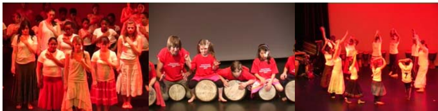
Participants perform in DANCE 'N' DRUM