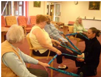
'Let's Twist Again!' workshop at Laurence Close

Autumn 2007 saw the launch of the project 'Let's Twist Again!' involving approximately 41 participants (not including carers and staff) in collaboration with Gateway Housing Association in Bow. The project's aims were to increase participants' mobility, physical health and confidence whilst stimulating their creativity and combating the sometimes isolated nature of their housing situation. All participants found they benefited from the workshops both physically and socially.